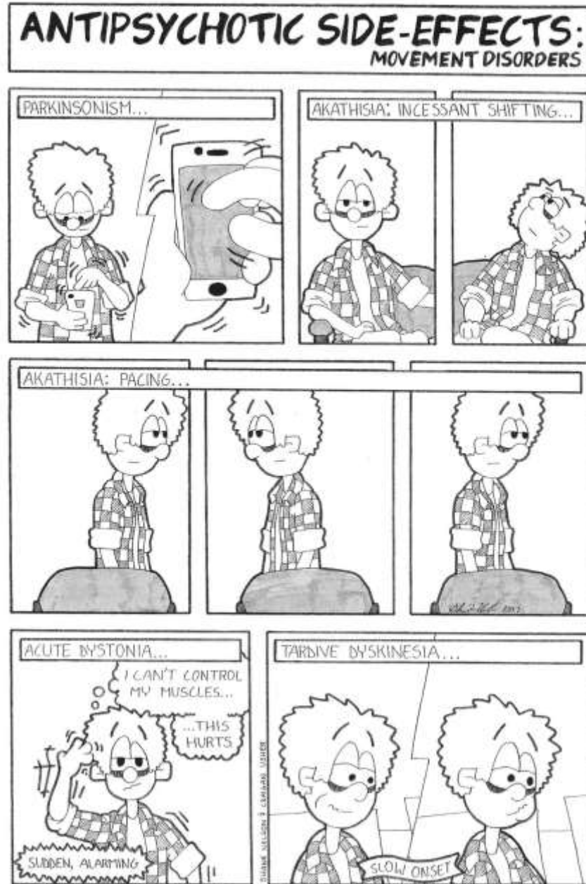
Figure 3: Concerning antipsychotic-induced movement disorders.

Another important side effect of antipsychotics to be aware of is called neuroleptic malignant syndrome (NMS.) This is rare but is life threatening. Symptoms include confusion, muscle rigidity (usually the whole body), fever, fast breathing, fast heart rate, and increased blood pressure. Participants with these symptoms should immediately be sent to an emergency department for assessment and treatment. It is most likely to occur early during treatment or after a medication adjustment but can occur at any time.