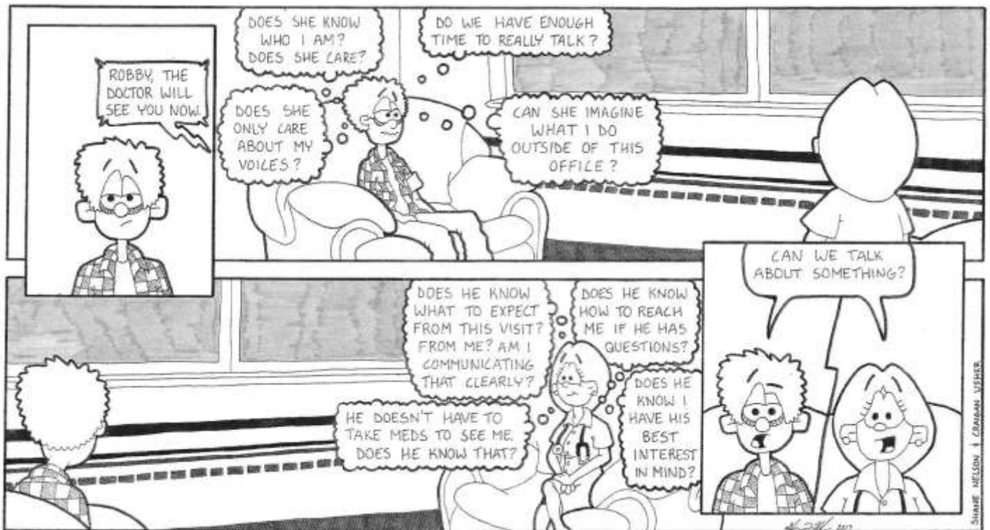
Figure 1: Things providers and participants need to talk about.

The third principal of EBM is that participants (traditionally called “patients” in medical parlance—likely because being in treatment requires a lot of patience!) fully join in medication/medical decision-making. This respects a person’s or their family’s preferences and the notion that participants are not passive medication-recipients but are active agents in their own care. To this end, it is important to be mindful that everyone’s subjective experience of medication treatment is different. Engaging participants in conversation first about who they are as a person, building a relationship of mutual respect before launching into medication treatment is vital.