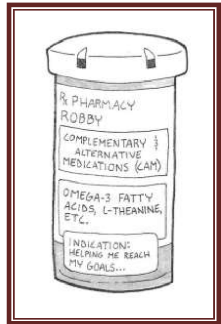
Table 10: Polyunsaturated Fatty Acids (PUFAs)

Polyunsaturated fatty acids (PUFAs) are the building blocks of cell membranes. Omega 3 fatty acids play a key role in healthy neurodevelopment. Individuals with a psychotic disorder have a lower concentration of omega 3 PUFA in their brain. Early research signaled that omega 3 supplementation may prevent or delay the onset of psychosis in individuals at ultra-high risk for a psychotic disorder[82], however, a follow up study did not confirm this to be true[83]. That is why, in the case example, when Roberto was having early warning signs of psychosis, his primary care physician suggestion PUFA or omega 3 treatment. The body cannot make enough of these fatty acids, so one must get them through either diet (fish and vegetable oils) or supplementation. Omega 3 polyunsaturated fatty acids are used as prophylactic treatment for children, adolescents, and young adults at elevated risk for psychosis.