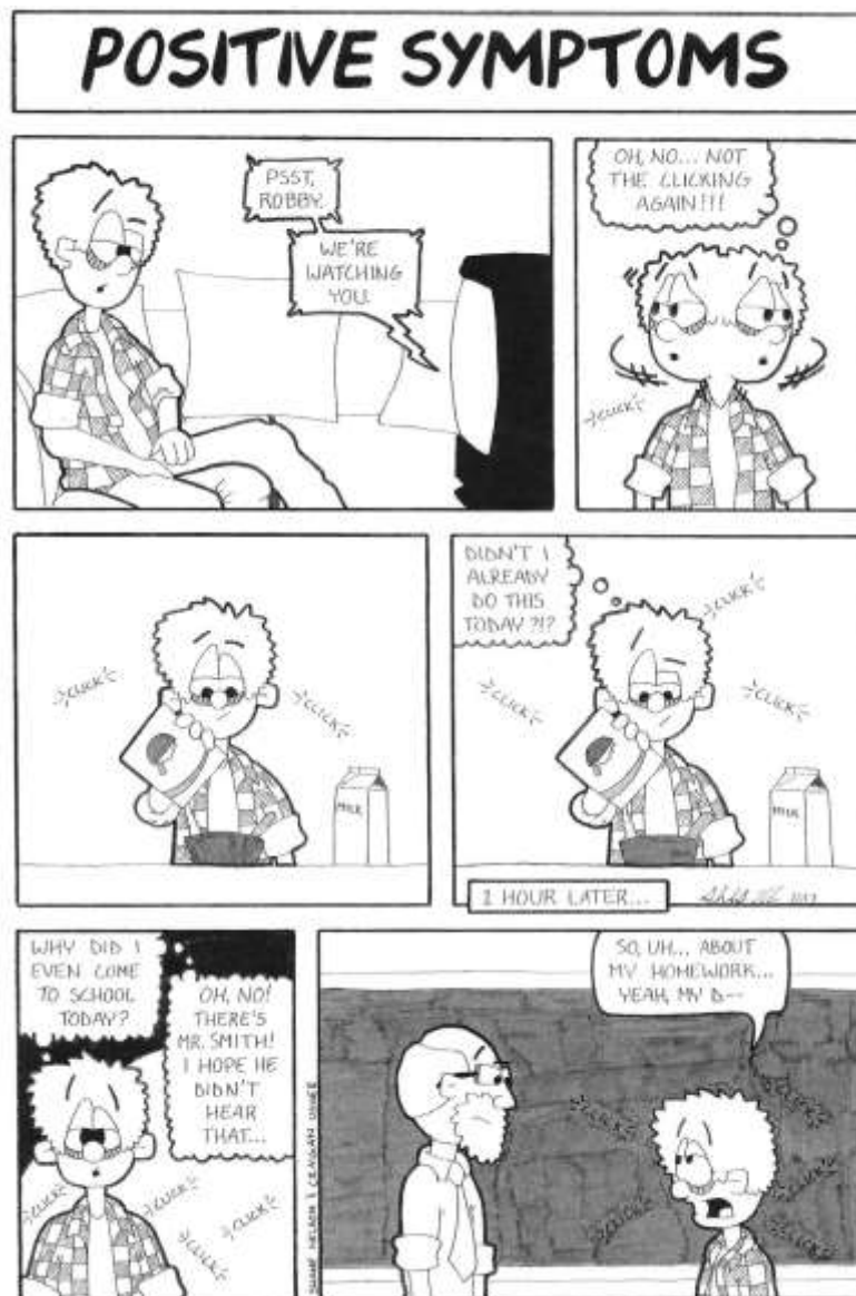
Figure 2: "Positive symptoms," the chief target of antipsychotics. Which positive symptoms can you identify in this?

An example of how we see drugs causing psychosis due to overstimulation of pathway occurs when individuals use methamphetamine (e.g. "crystal meth") as this substance causes a rapid increase of dopamine in the brain, often leading to racing thoughts, hypervigilance and paranoia.[13]