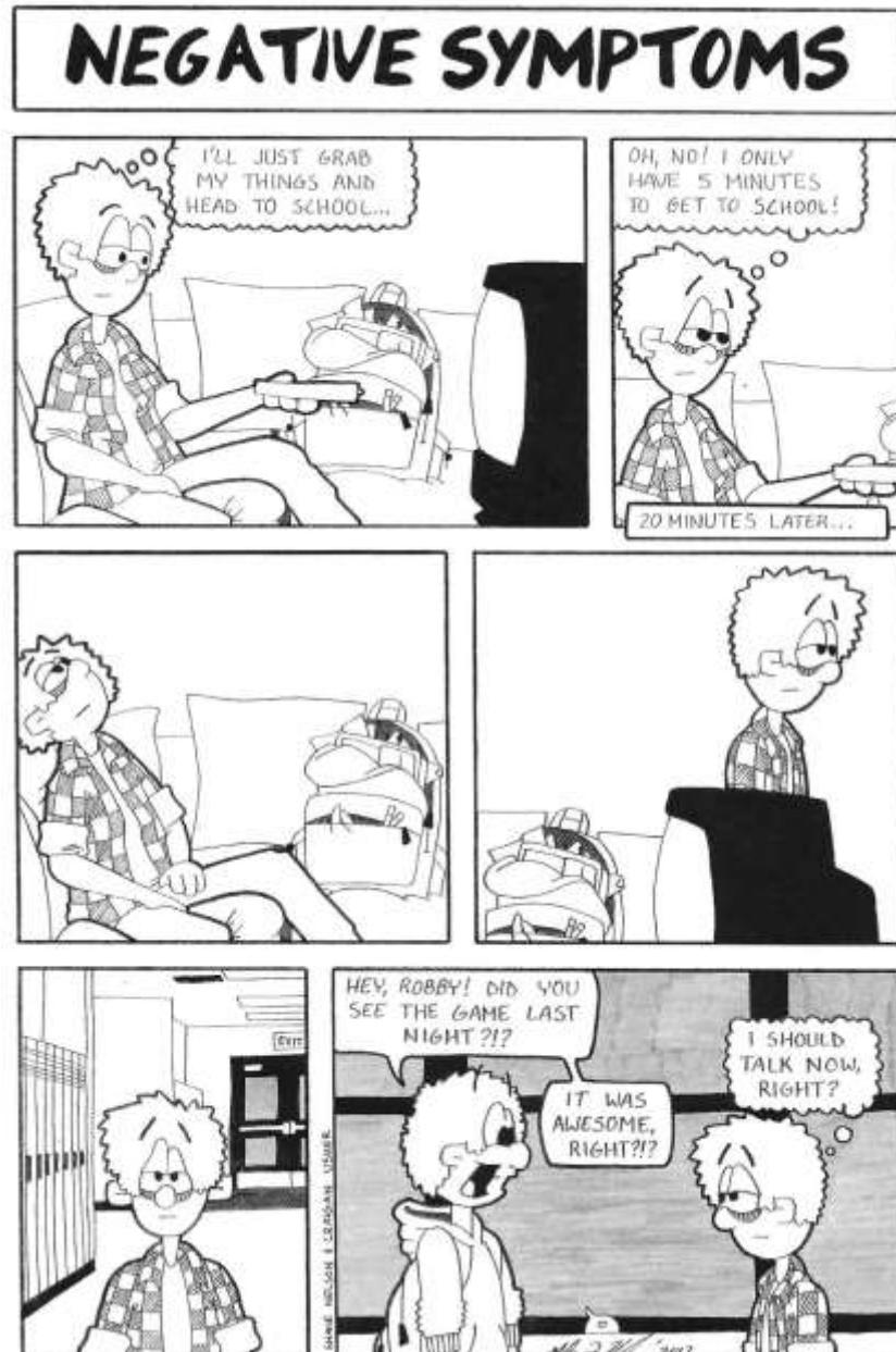
Figure 5: Negative symptoms of psychosis. Which symptoms can you identify in these panels?