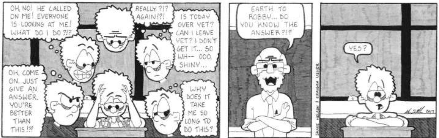
Figure 4: “Robby” overwhelmed at school.

person who develops psychosis as the internal running negative thoughts of anxiety disorders have overlap with auditory hallucinations (see Figure 2.)